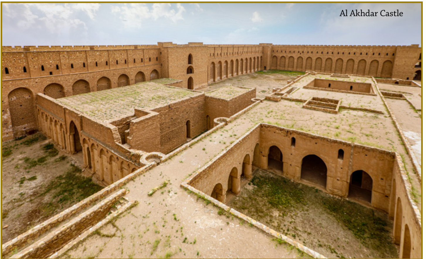
Al Akhdar Castle