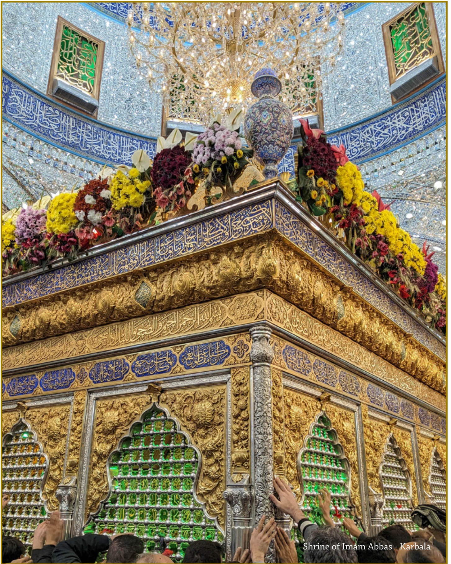
Shrine of Imam Abbas - Karbala