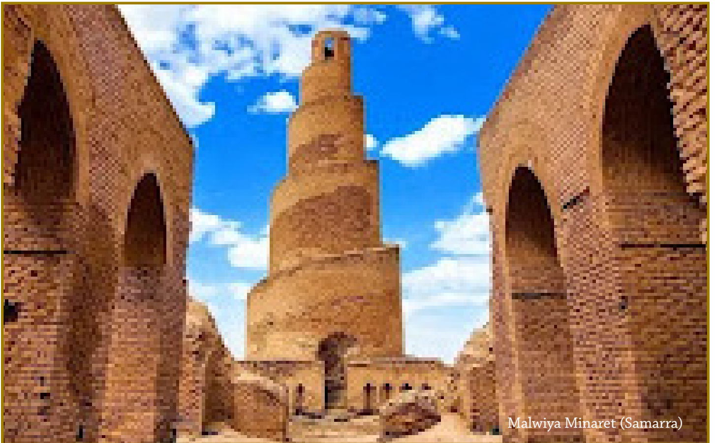
Malwiya Minaret (Samarra)