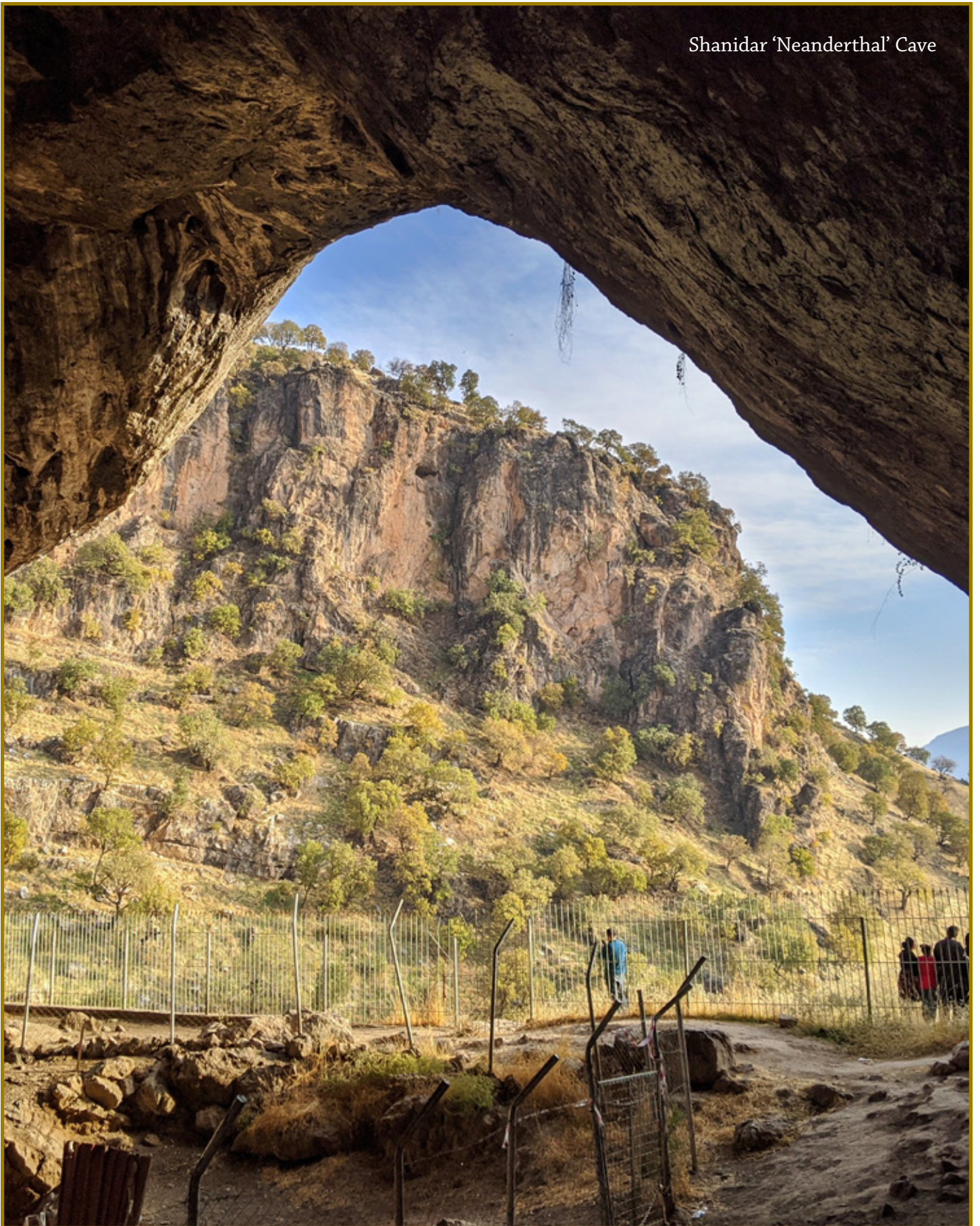
Shanidar 'Neanderthal' Cave