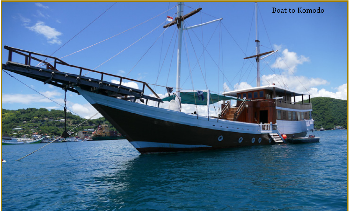
Boat to Komodo