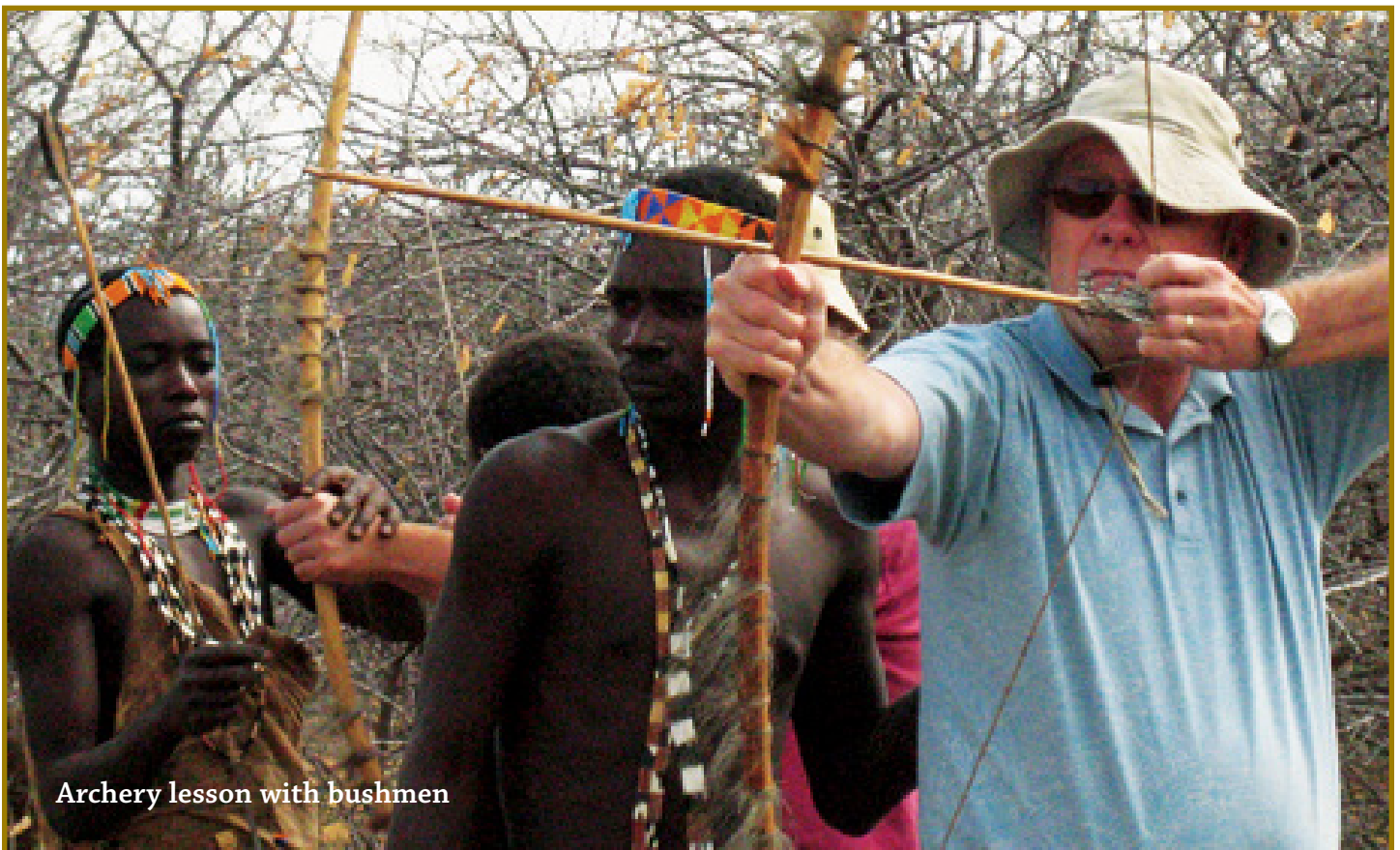
Archery lesson with bushmen